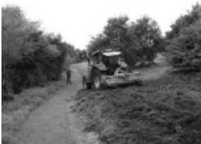
Wildflower restoration area at Gorse Farm Wood

Gorse Farm Wood has already seen both heathland creation and wildflower meadow restoration, and will later see improvements to the main stream and the removal of fly-tipping from local residents.