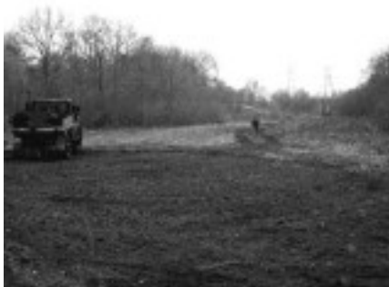
Preparation for the Heathland

The area in Priory Woods under the electricity pylons, known as the ride, has been developed as part of a heathland creation scheme. Top soil has been removed to reveal the underlying sandy subsoil, upon which cuttings of heather have been spread, sourced from Staffordshire Country Council.