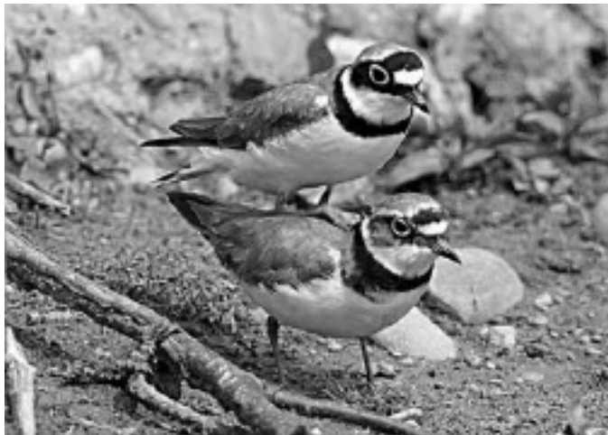
Treading pair of LRP at Forge Mill Lake on 9th June (AJP).

A lapwing with 2 young was on North Island on the 27 th , and on the same day 20 house martins and a swift were over FML. A marsh tit was on the RSPB reserve on the 28 th , when 2 wheatear and 2 whinchat were also seen off Salters Lane. 4 little ringed plover were still at FML on the 30 th , when 6 gadwall were also present on the lake.